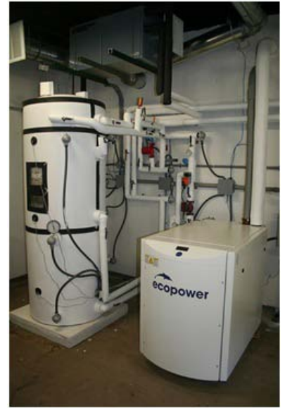
CHP Unit and Thermal Storage Tank

The thermal energy produced by this system can be used for space-heating, domestic hot water, process heating, dehumidification, and absorption cooling. In this demonstration setup, the thermal loads are hydronic heating and dehumidification. An experimental outdoor heat dump is also used to control the setup for application specific modeling. This DG system is completely grid-tied making it an efficient means to trade electric energy